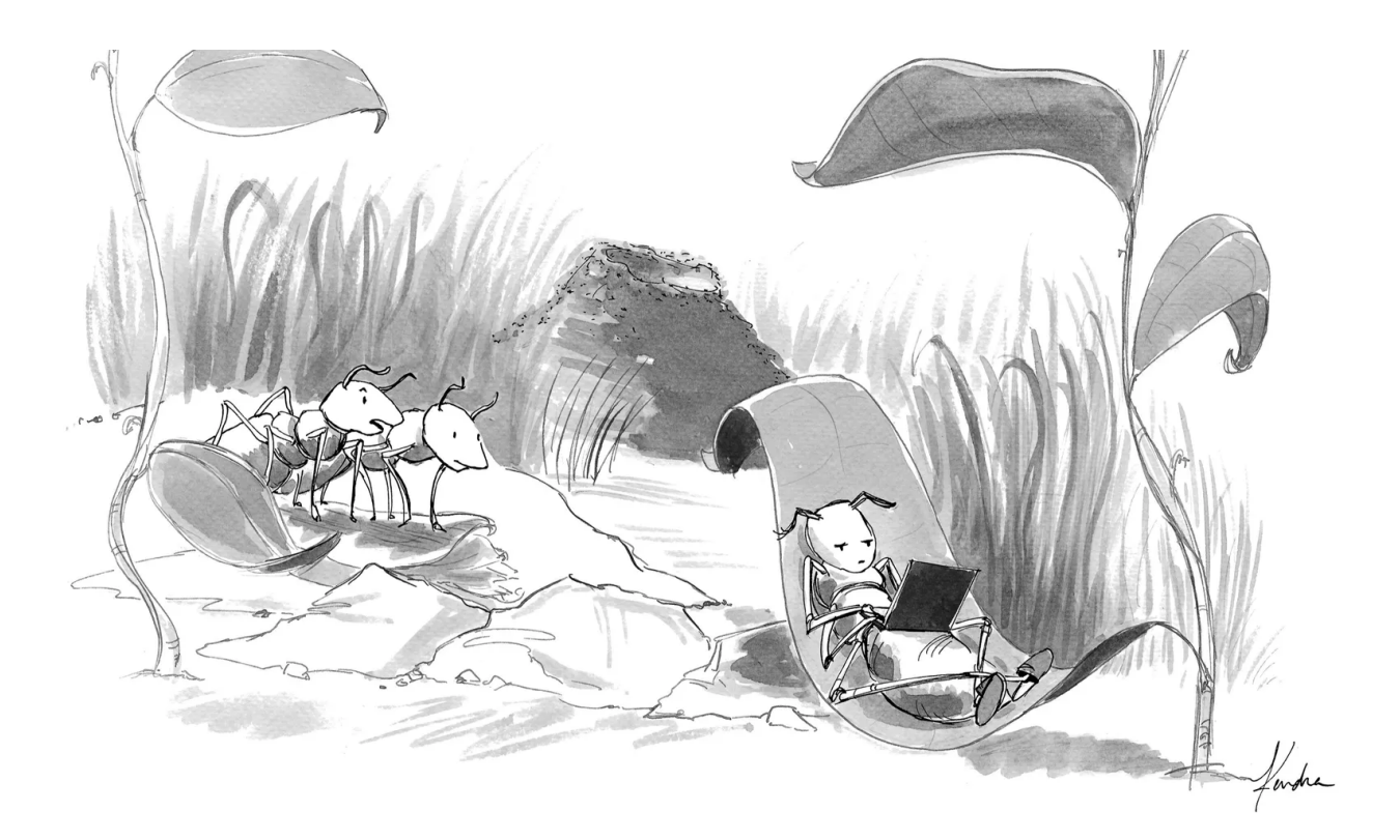
"You really think they'll come back to the hill after they've gotten used to working remotely?"